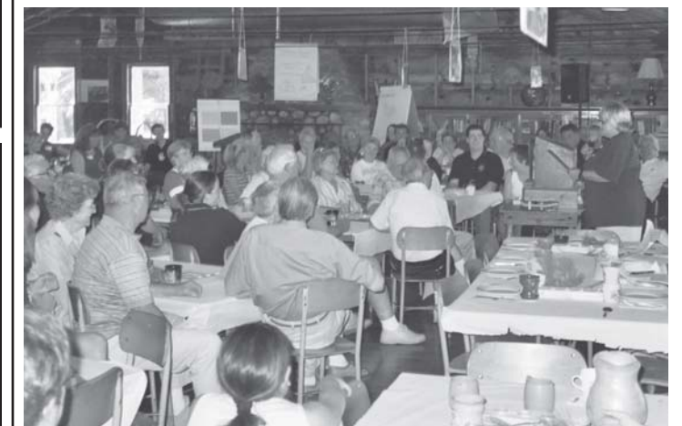
"Memories Linger On" July 8-10, 2005: Alumni could be seen on guided tours, pontoon boat rides, climbing the Lighthouse, sailing, swimming, and enjoying high tea on the porch of the Dining Hall!

Save the date: August 25-27, 2006, for the revival of the traditional end-of-summer work camp! Whether you are a Baby Boomer, or a member of the Boomerang generation, the Camp Westminster Alumni Committee wants to see YOU at the Wake-Up Wakeya Work Weekend.