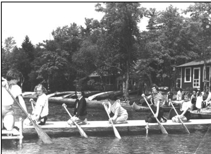
Perfecting their strokes before paddling on Higgins Lake, campers participate in canoeing class at Girls Camp.

from even one week at camp. In addition they benefit from camp in the following ways: “they become more adventurous and willing to try new things, grow more independent and show more leadership qualities, develop more social skills that help them make new friends and become more confident and experience increased self esteem.”