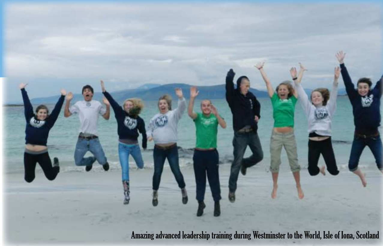
Amazing advanced leadership training during Westminster to the World, Isle of Iona, Scotland

What is an outtrip or an expedition? For some campers, it may be a one-day canoe trip on the Au Sable River . For others, it may be a ferry ride and 3 days camping on South Manitou Island (a favorite for first-time trip participants). For others, it may be hiking along the Pictured Rocks National Lakeshore or rock climbing and hiking in Devil's Lake, Wisconsin .