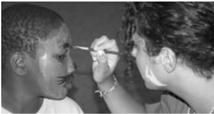
Facepainting is very popular at the carnival for ages 7-11!