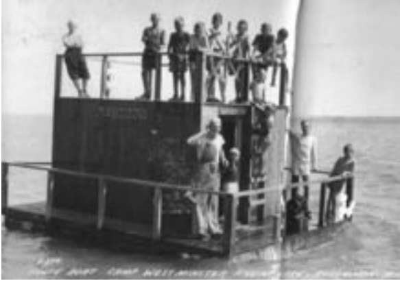
Campers enjoy the camp houseboat, the Westminny, on Higgins Lake in the 1930s.